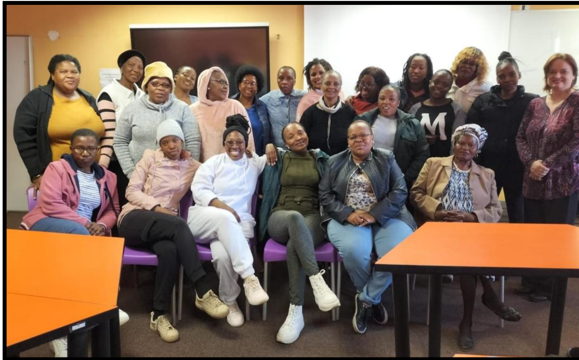
The 2024 group of Abigail students sponsored by ArcelorMittal and Itirele Foundation Charitable Trust.

Monitoring and evaluation are done in the form of a proficiency Index, a multi-tiered business assessment, which participants complete pre- and post- training to measure the impact on and growth of each of the businesses.