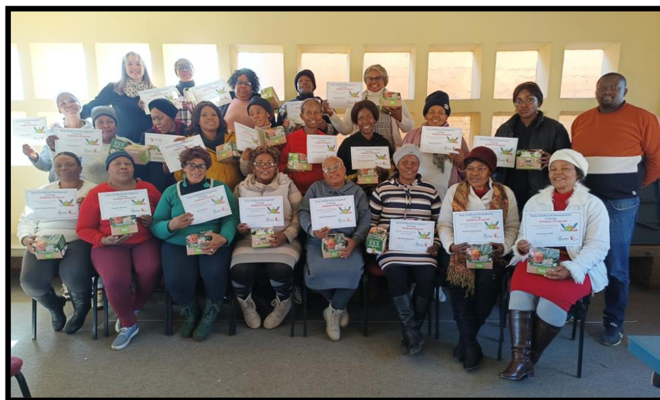
ECD Gr8Start and Garden in a Box Training at Bophelong Library sponsored by Prommac.